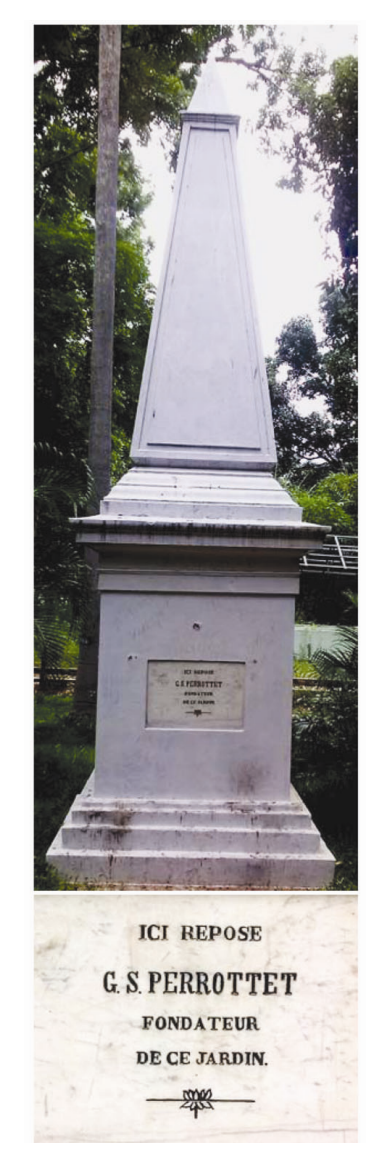
Figure 1. The Perrottet memorial at Jardin Botanique de Pondichéry (photo courtesy: S. Prasad, l'Institut Française de Pondichéry, Puducherry).

Perrottet (Figure 2) was born in 1790 (1793?) in Vully of Vaud Canton of French-speaking Switzerland. He started